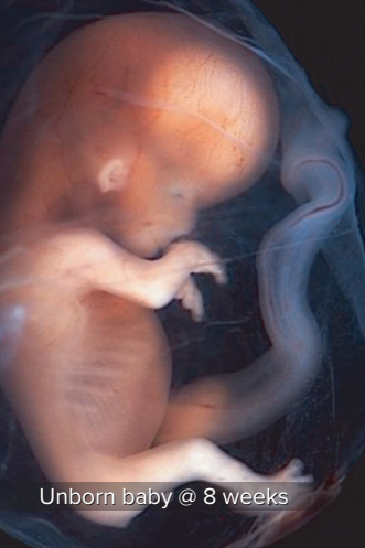
Unborn baby @ 8 weeks

Did you know... many of the vaccines for Coronavirus (COVID-19) have been tested on, or contain cell lines that were originally derived from tissue of babies killed by abortion in the 1970s and 1980s.